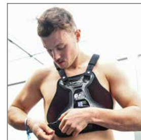
Billy Bolt 5-time Hard Enduro & Super Enduro World Champion