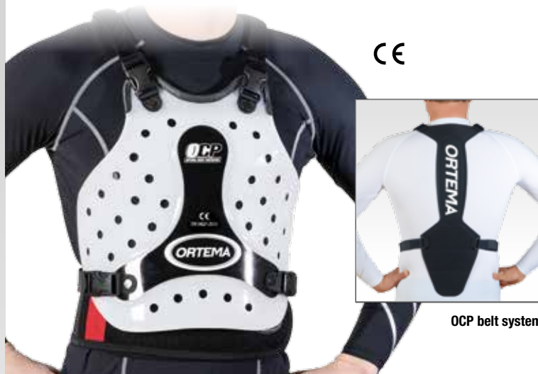
OCP belt system