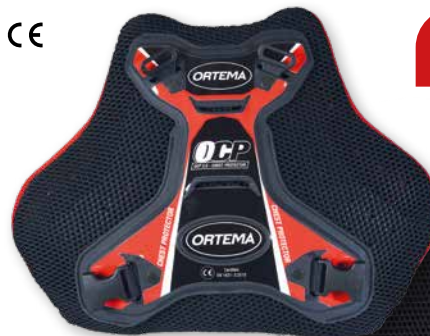
Version size S-M