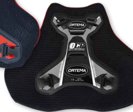
Version size L/XL